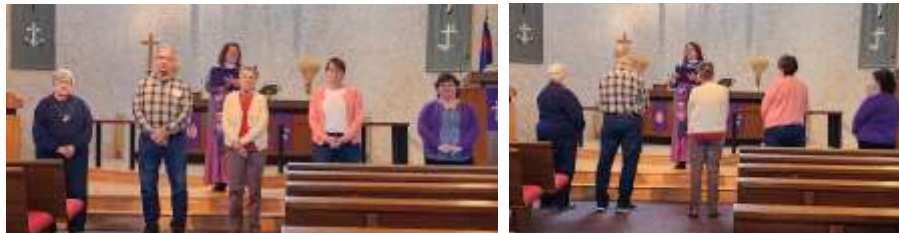
Installation of Council