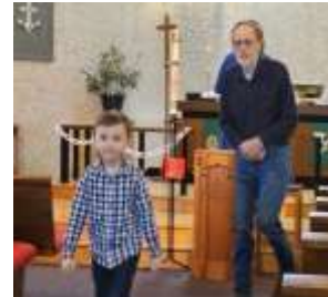
Helpers at worship